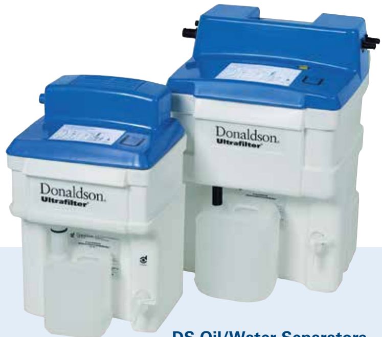
DS Oil/Water Separators

Donaldson DS oil/water separators utilize gravity to separate oil/water mixtures and purify the condensate to a residual oil content of 20 ppm or lower. It is designed to meet or exceed those discharge levels as efficiently and economically as possible. The DS oil/water separator is available in seven models ranging from 70 to 4,240 scfm.