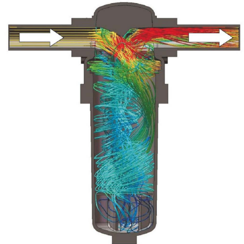
Flow Optimized Design