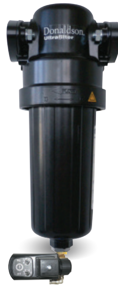
DF-C Standard with UF-2 time controlled condensate drain

Available in six different sizes with a flow range from 70 to 647 scfm at 100 psig. Conforms to European directive 97/23/EG for pressure vessels.